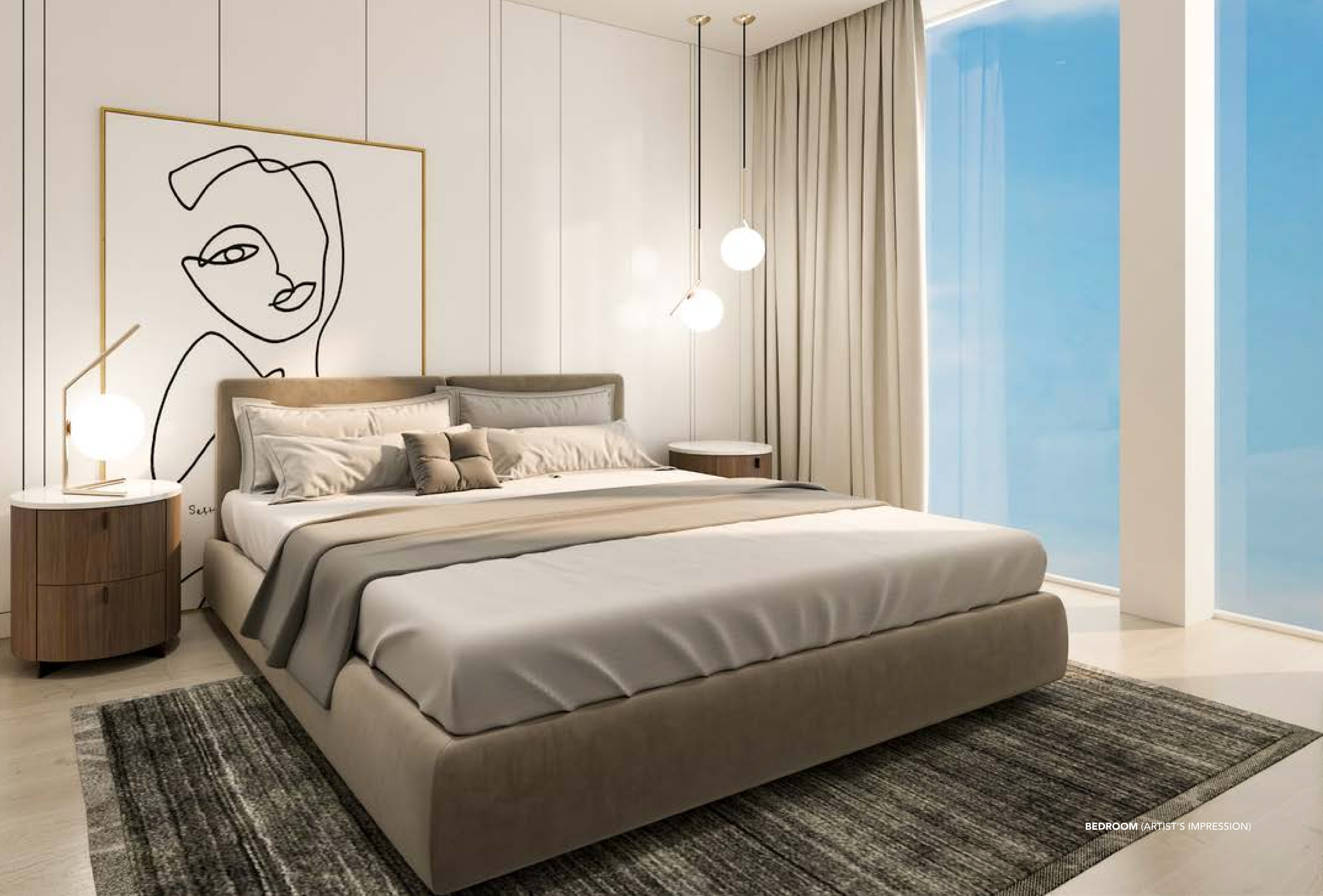
BEDROOM (ARTIST'S IMPRESSION)