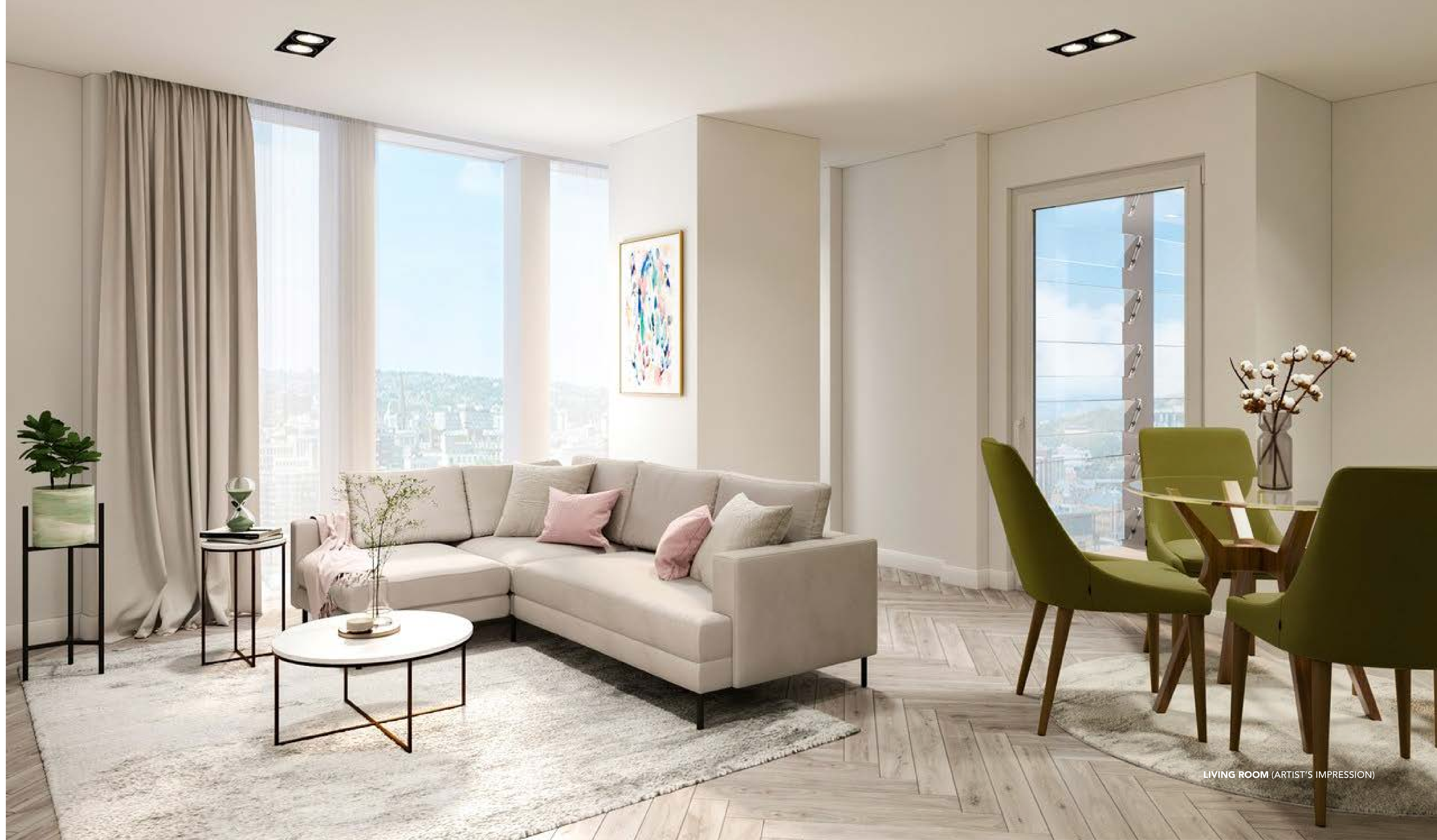
LIVING ROOM (ARTIST'S IMPRESSION)