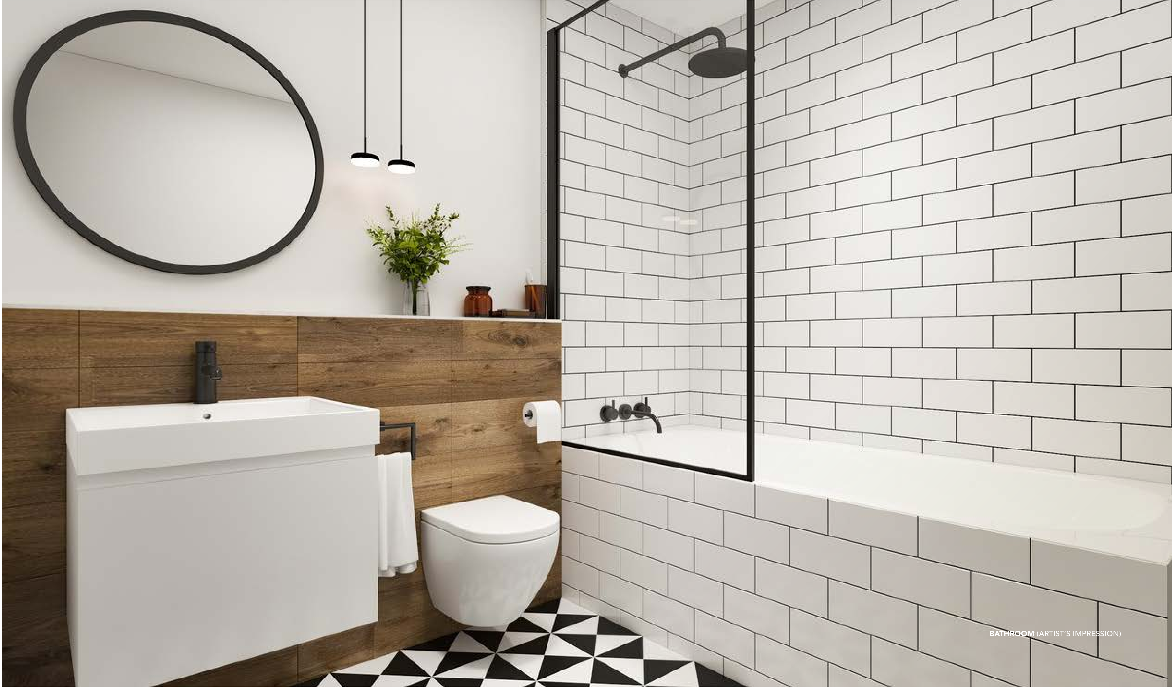
BATHROOM (ARTIST'S IMPRESSION)