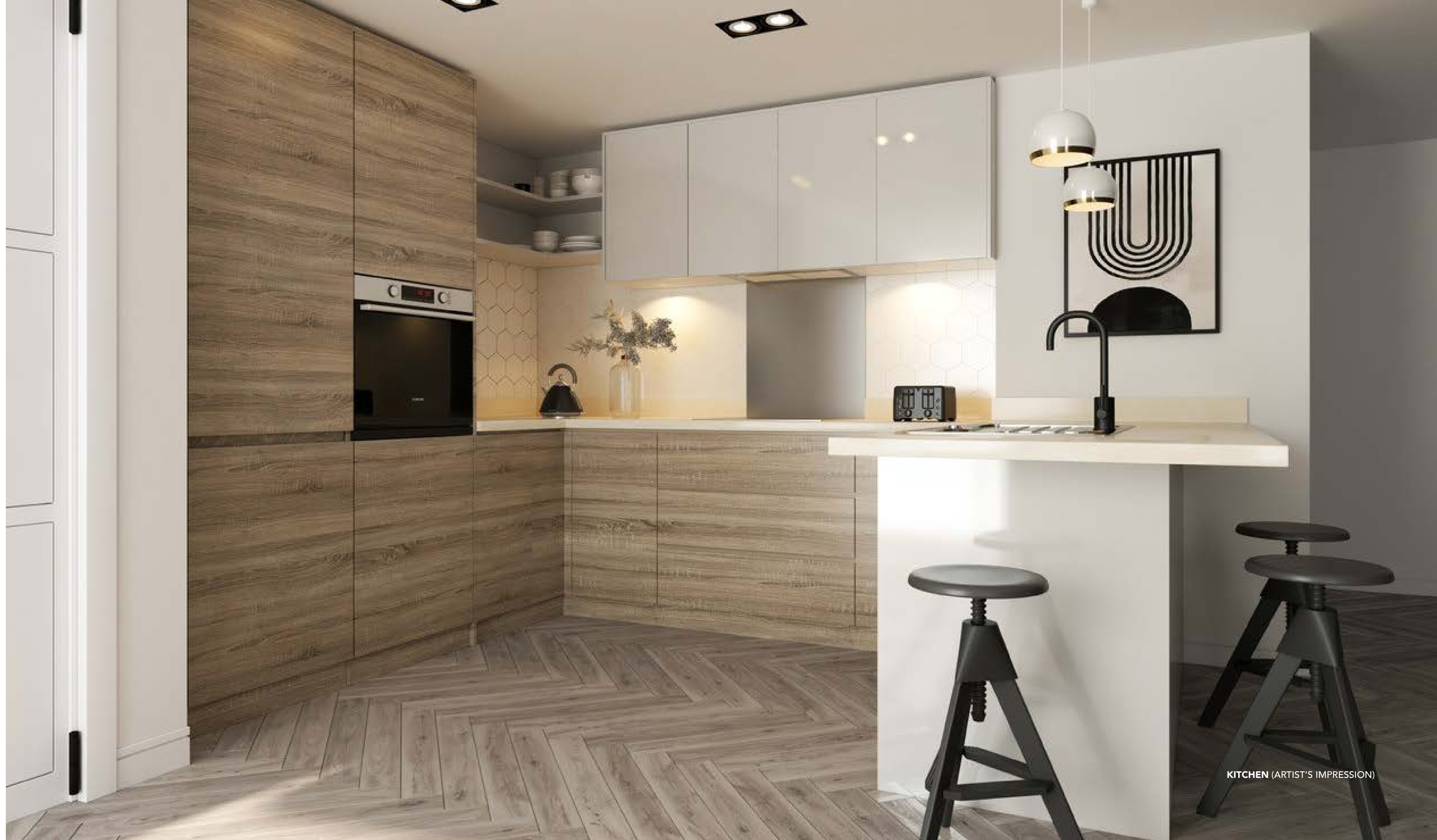
KITCHEN (ARTIST'S IMPRESSION)