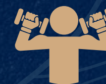
Outdoor & Rooftop Gym