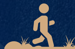
Rooftop Jogging track