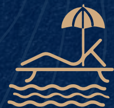
A luxurious and large Leisure Pool Deck