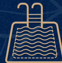
Private pools inside apartments