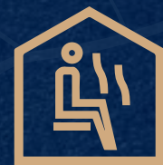
Sauna & Steam Room