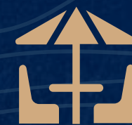
Roof Top Lounge