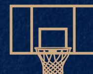
Rooftop basketball court