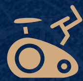
Indoor Health Club